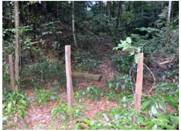
Fig. 4. Habitat where Ptychoglossus brevifrontalis was collected at the BNP.

One juvenile female of P. brevifrontalis , voucher number NZCS R679, was collected on 01 November 2014. The location where the specimen was collected was covered with dried fallen leaves and consisted of