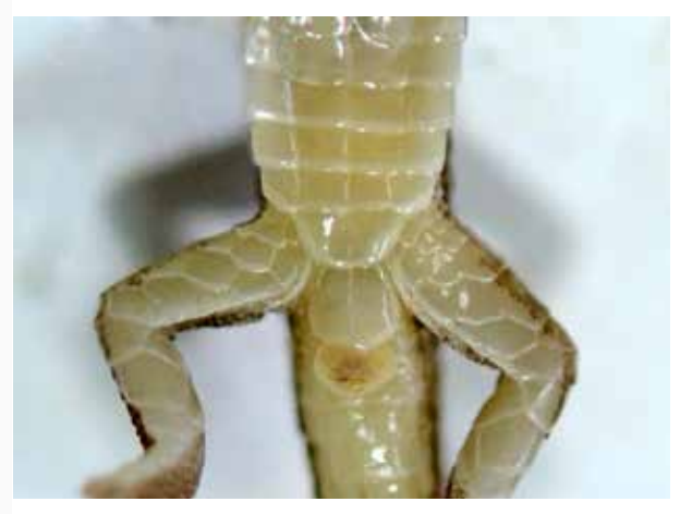
Fig. 1. Map showing the occurrence of P. brevifrontalis in Suriname. The blue dot represents the first recorded specimen from Suriname while the red triangle depicts the specimen collected at the BNP. Fig. 2. Lateral view of head of P. brevifrontalis showing the labials. Fig. 3. Anal scales of P. brevifrontalis .

The different habitats found on the Brownsberg make this an interesting place in terms of research purposes. Some of these habitats are undisturbed streams and forests, and some are streams disturbed by mining and habitats of recently disturbed forests (De Dijn et al. 2007). The faunal diversity is high and represented by approximately 116 species of mammals, 387 species of birds, and 144 species belonging to the herpetofauna (De Dijn et al. 2007). The collected specimen of P. brevifrontalis extends the species range approximately 372 km in northeastern direction, measured from the last known record of this species in Suriname. The specimen was captured by hand during a survey conducted on a trail going towards the Leo falls (Fig. 1). The specimen was euthanized using lidocaine, subsequently placed in four percent formaldehyde, and later transferred to 70% ethanol for long term preservation and storage at the National Zoological Collection of Suriname. Species identification was facilitated by examination of the following traits: total length (from tip of the snout to the tip of the tail), snout vent length (from the tip of the snout to the cloaca), the number of supraoculars, supra labials, infra labials (Fig. 2), chin shields, lamellae under fourth finger, and fourth toe and anal scales (Hoogmoed 1973; Avila-Pires 1995). Sex was determined by the absence of